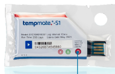
Status Request or Set Mark (optional)